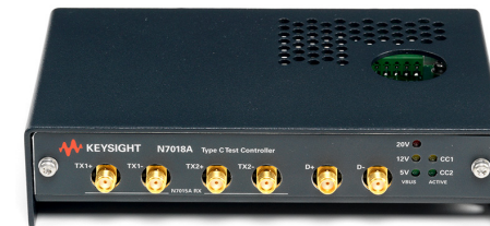
N7018A Type-C Test Controller

Other Keysight Type-C Product(s) for use with N7015A (sold separately)