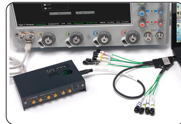
N7015A setup with N7018A Type-C Test Controller

Connect the N7015A to the Device Under Test.